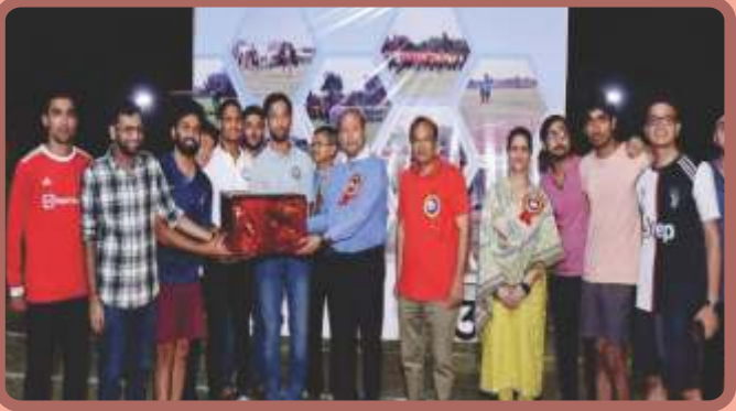
Unnat Bharat Abhiyan Activities