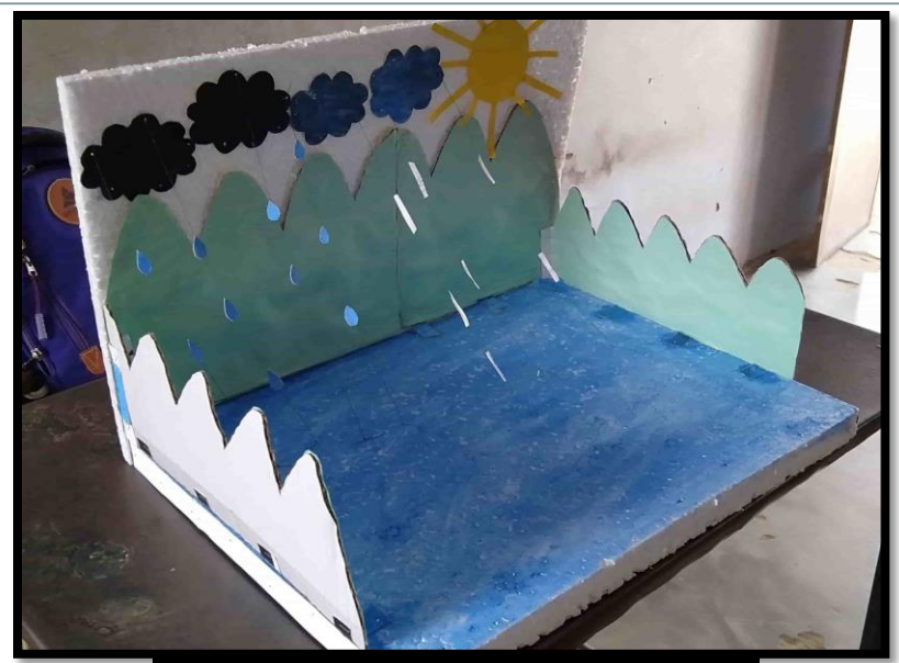
Water Cycle Model