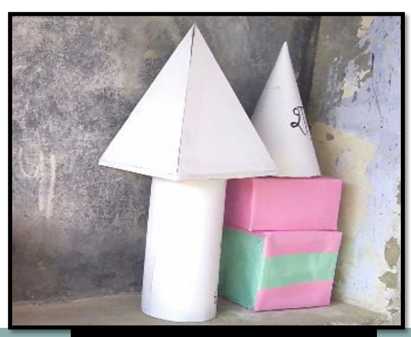
2D & 3D objects Model