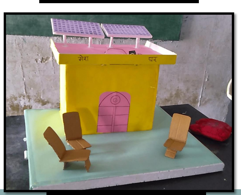
Solar Energy Model