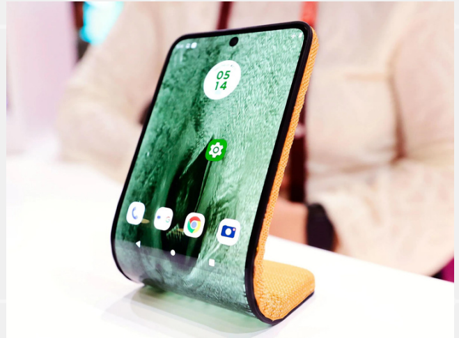
Motorola exhibited a concept rollable smartphone that wraps around the wrist and bends in multiple positions, at the Mobile World Congress 2024 in Barcelona.

The Mobile World Congress (MWC), a technology convention held each year in Barcelona, placed a spotlight on rollable phones like the Phantom Ultimate, a scroll-like concept from Tecno Mobile, and Motorola's Adaptive Display Concept, a phone that can wrap around your wrist like a smartwatch. They were followed by a new patent filed by Samsung that hints at a future smartphone or tablet that rolls up like a newspaper.