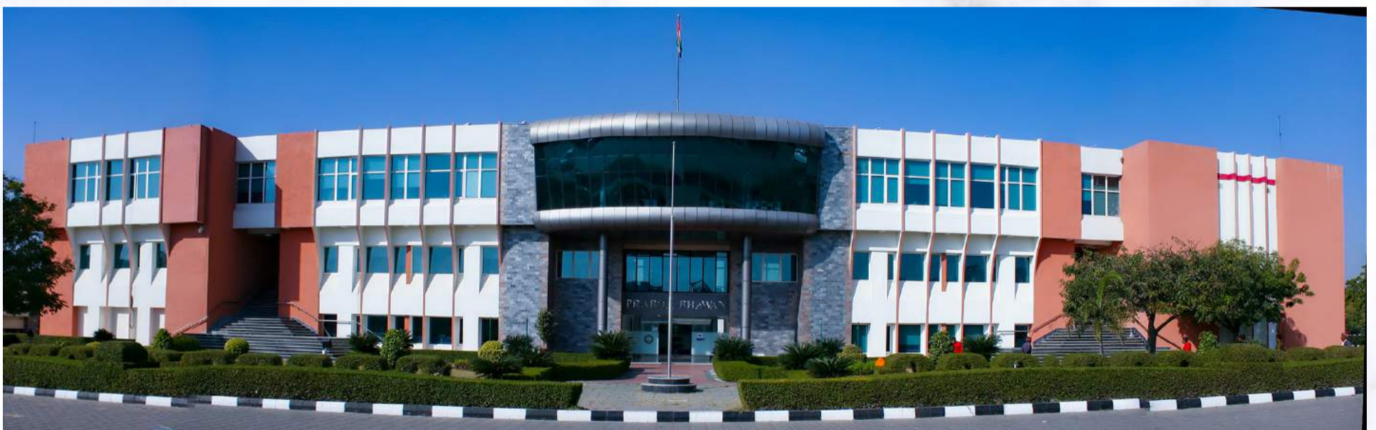
Prabha Bhawan, MNIT, Jaipur