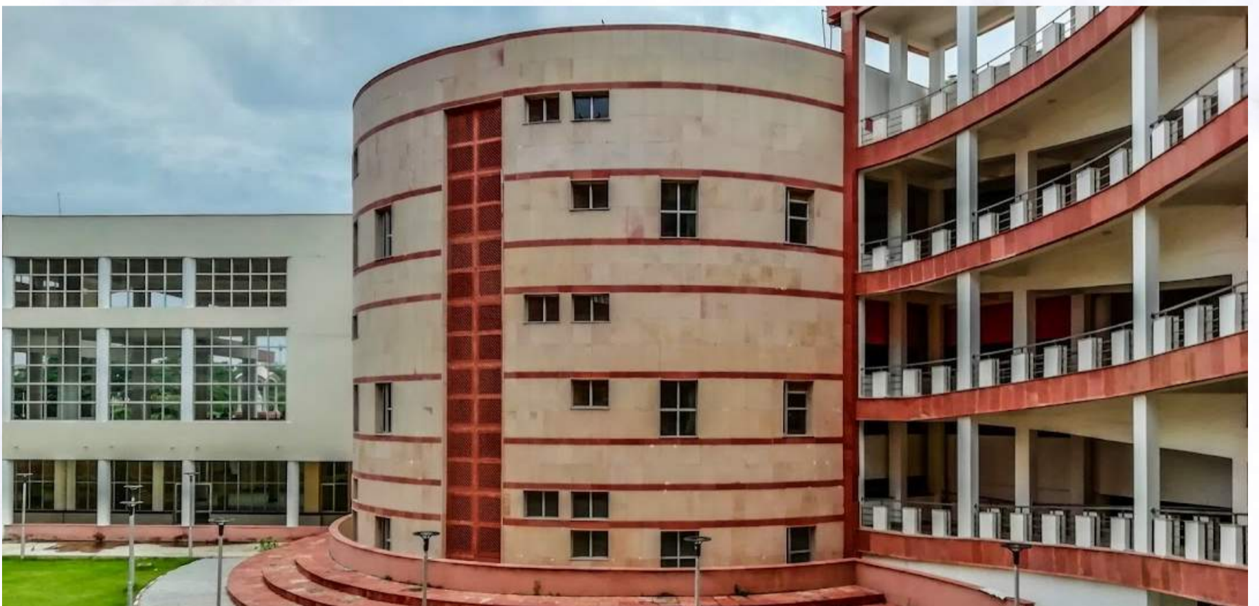
Vivekanand Lecture Theatre Complex, MNIT, Jaipur